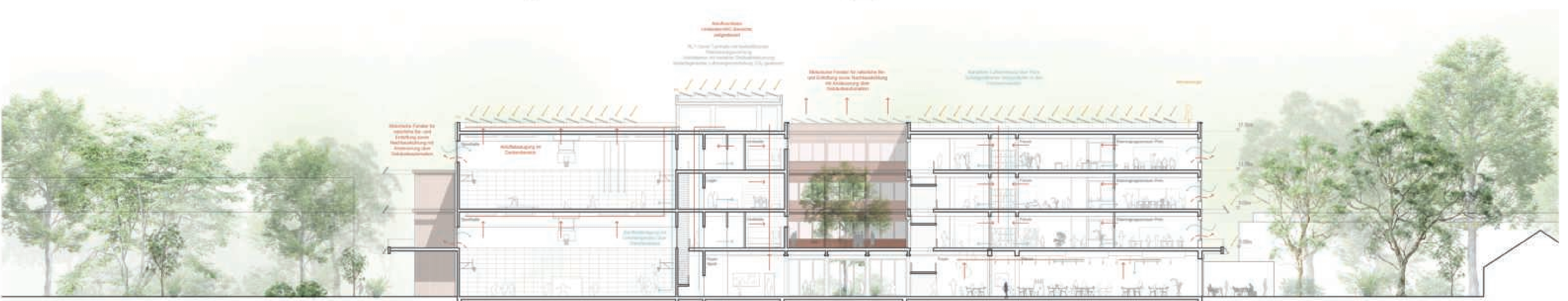
SYSTEMSCHNITT NORD-SÜD 1:200