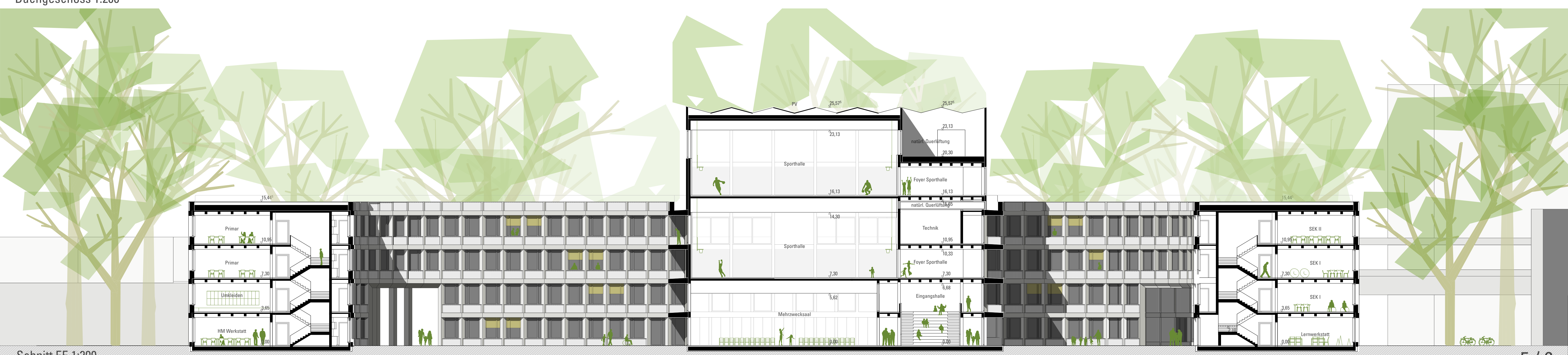
Schnitt EE 1:200