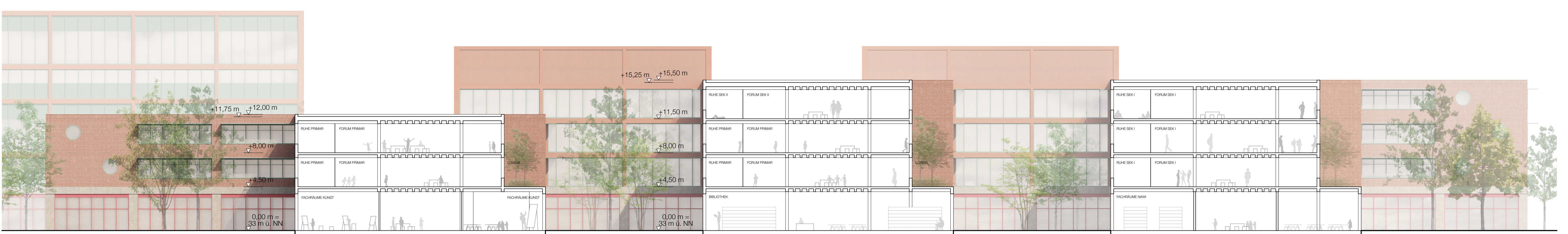
Schnitt C-C 1:200