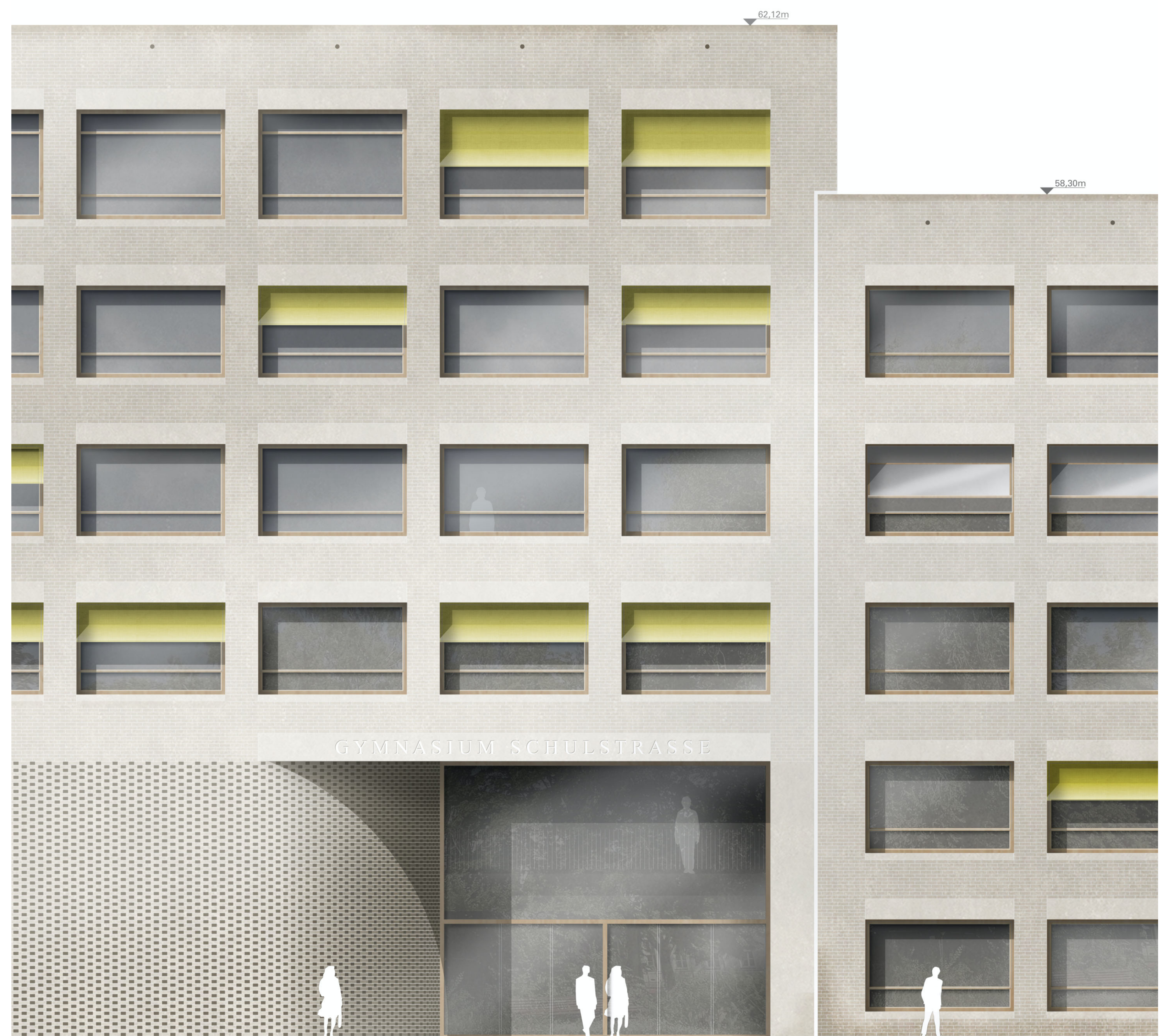
FUNKTIONALER AUSSCHNITT M.1:50