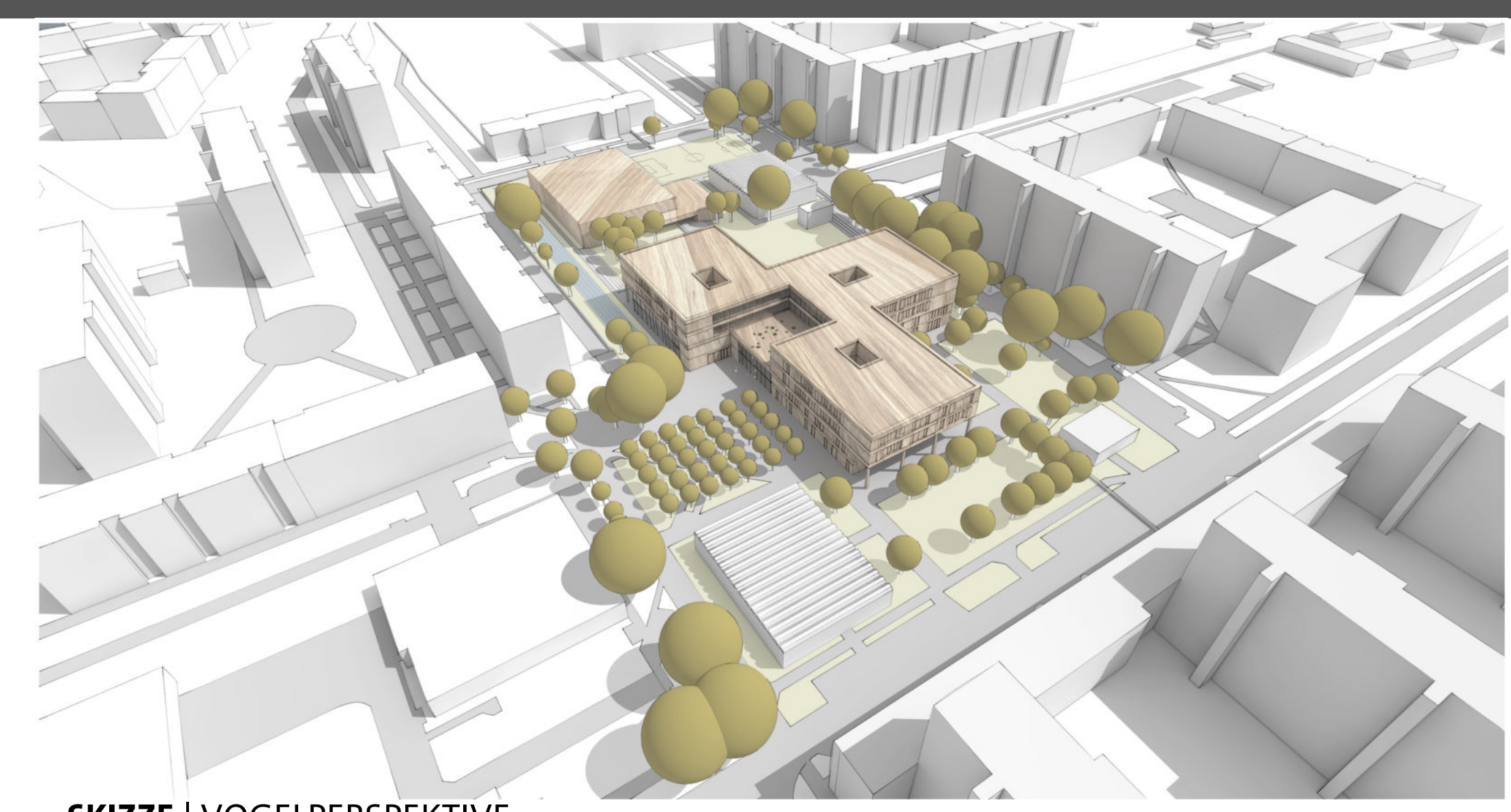
SKIZZE | VOGELPERSPEKTIVE