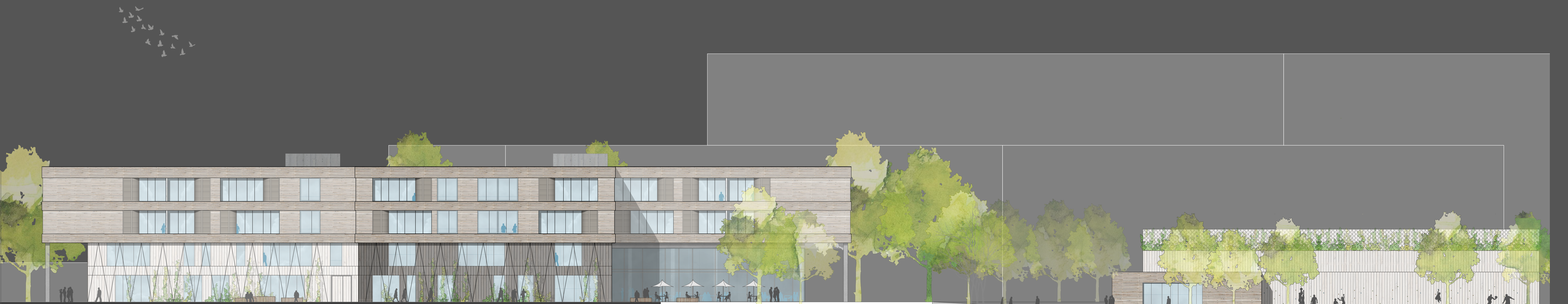
ANSICHT SÜD-WEST | 1:200