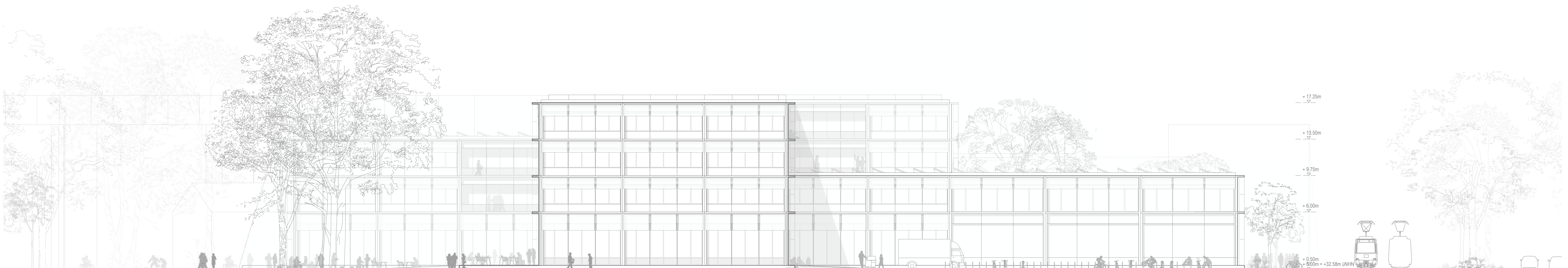
ANSICHT OST 1:200